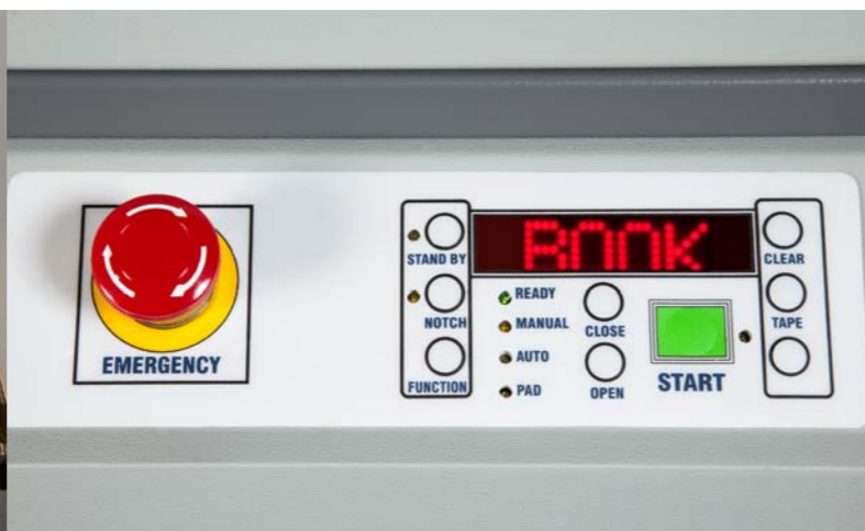
User-friendly control panel